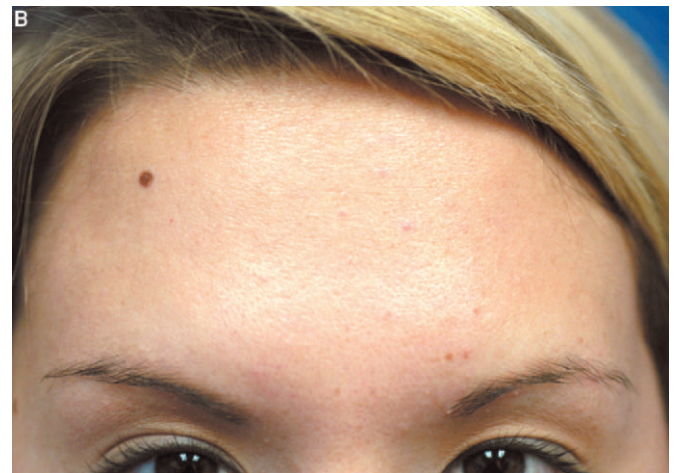
Figure 4. (A) Forehead lines, pretreatment; (B) forehead lines, right side treated with ThermaCool (fast tip) 5 minutes after botulinum toxin injection.