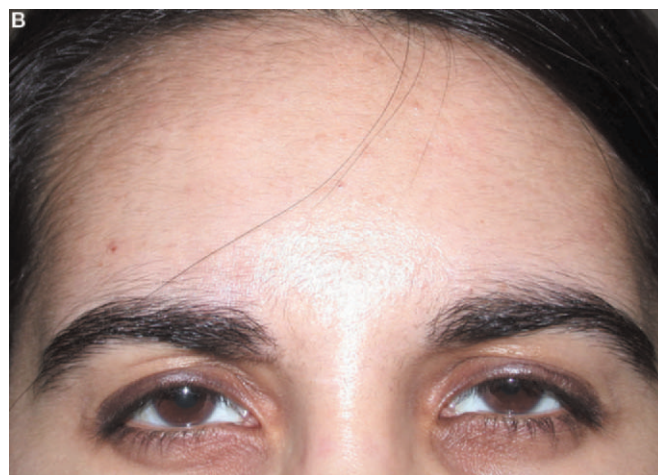
Figure 2. (A) Glabellar lines, pretreatment; (B) glabellar lines, left side treated with CoolGlide 8 minutes after botulinum toxin injection.