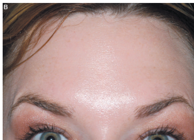
Figure 1. (A) Forehead lines, pretreatment; (B) forehead right, side treated with ThermoCool (fast tip) 5 minutes after botulinum toxin injection.