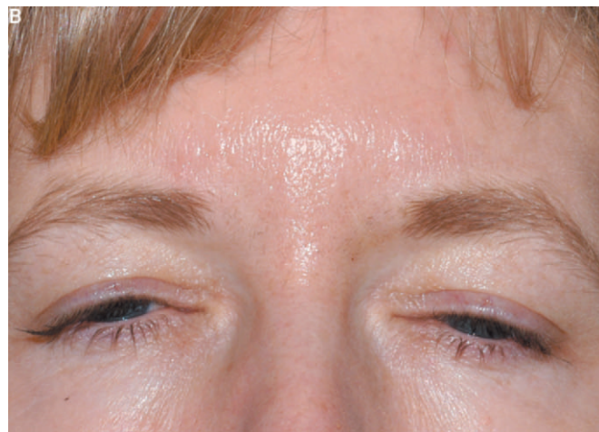
Figure 6. (A) Glabellar lines, pretreatment; (B) glabellar lines, left side treated with ThermaCool 5 minutes after botulinum toxin injection.